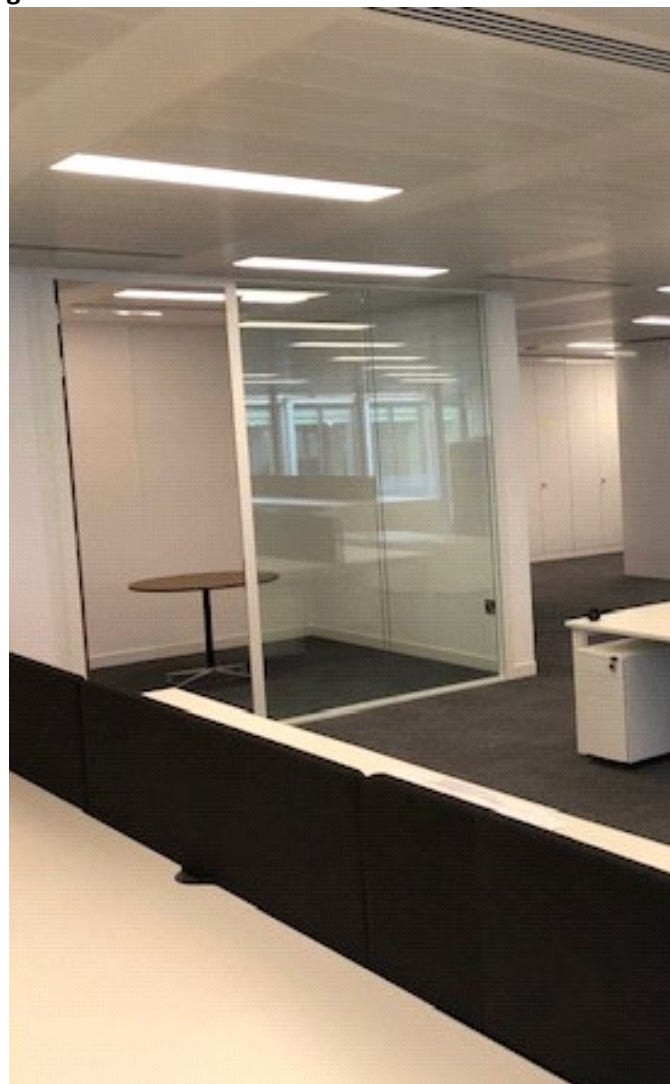
New Glazed Partitions